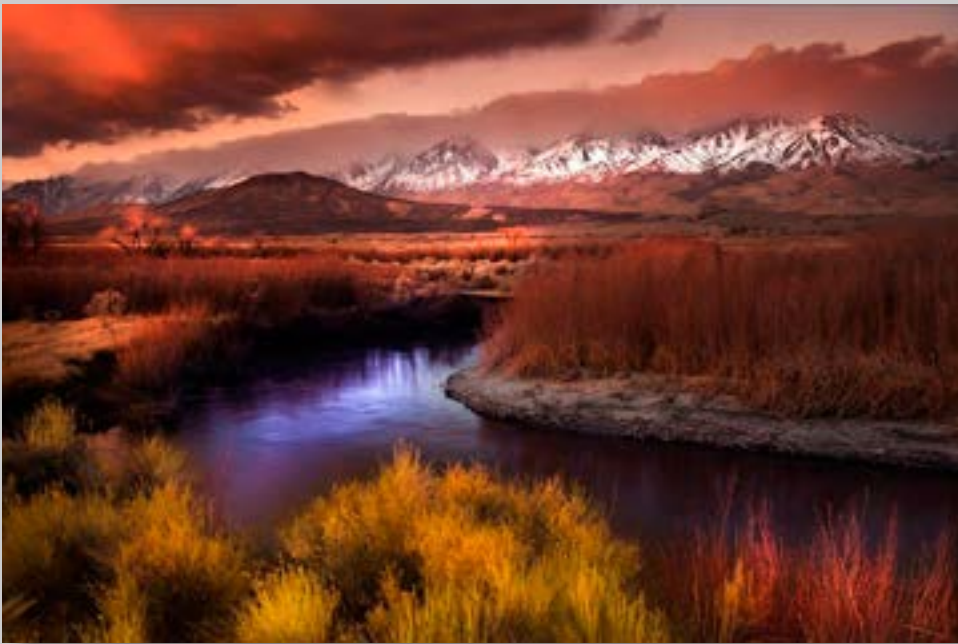
First Place Landscape Vandana Bajikar "Down the River "