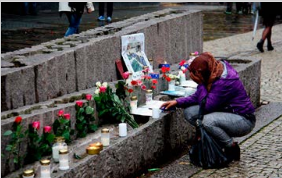
First Place Photojournalism Betty Toland "Anguish"