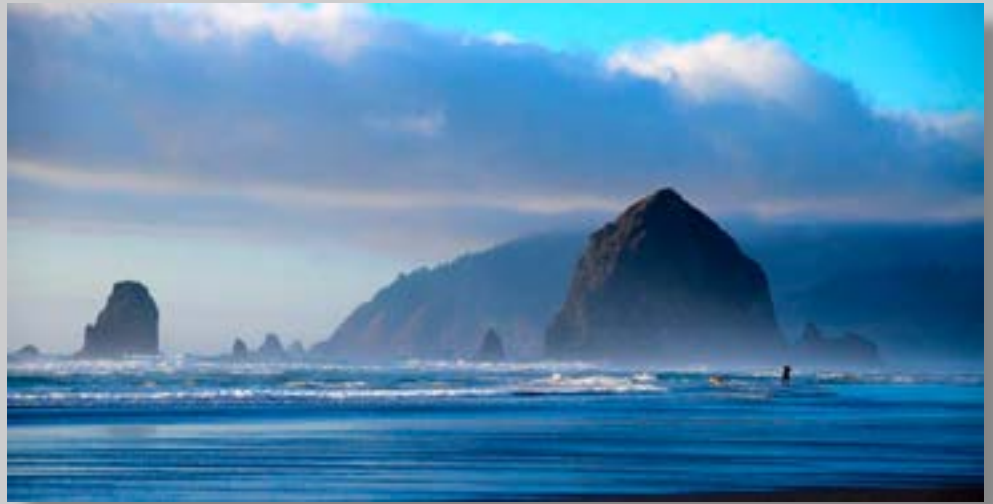
First Place Scenery Mabel Lux "Fun In The Surf"