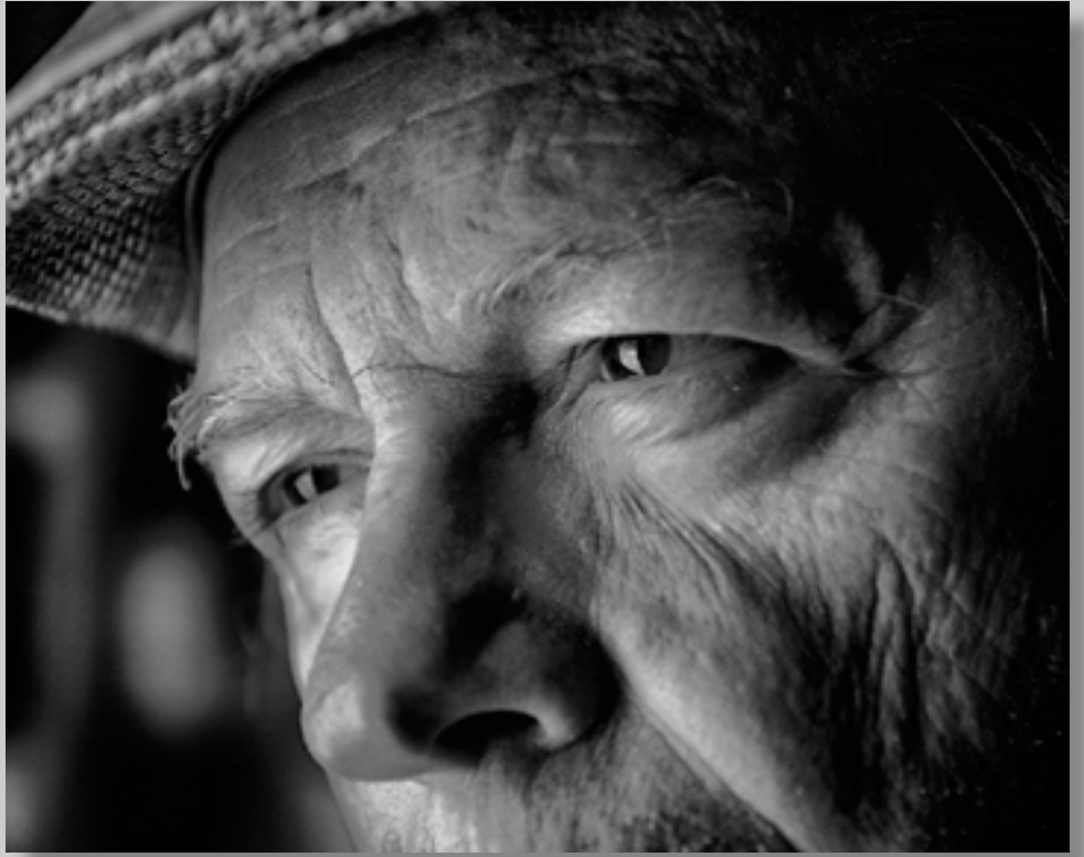
First place Monochrome Print James Kirk "Growing Old"