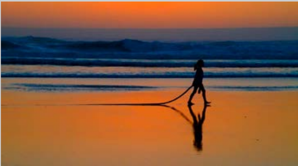
First Place General Mabel Lux "Girl with Kelp"