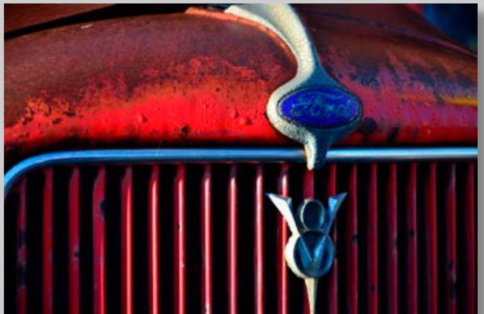
First Place Small Color Print Mike Lux "Ford-Built Tough"