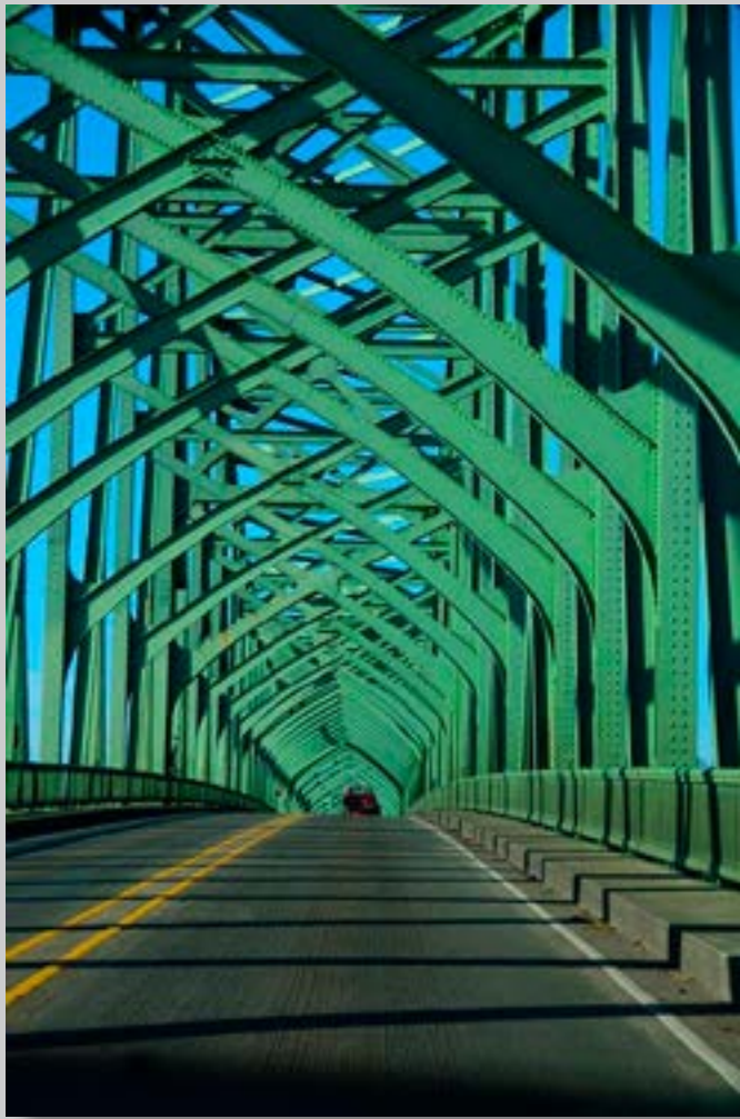
First Place Architecture Mabel Lux "Cathedral Bridge"