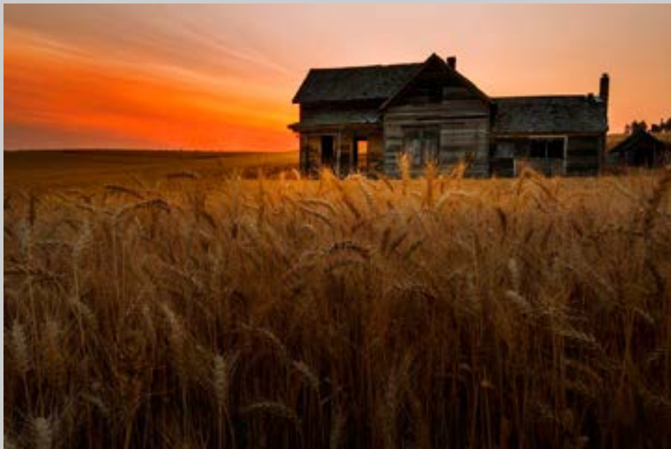
Best Print of Show & First Place “Large Color Print” Vandana Bajikar “Barn/Wheat Filed at Sunrise”